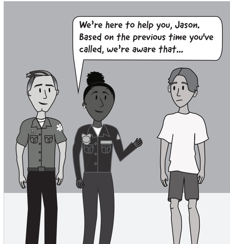
With access to information allowed by their profession, law enforcement and medical personnel conduct an informed conversation built on Jason's previous calls for help.