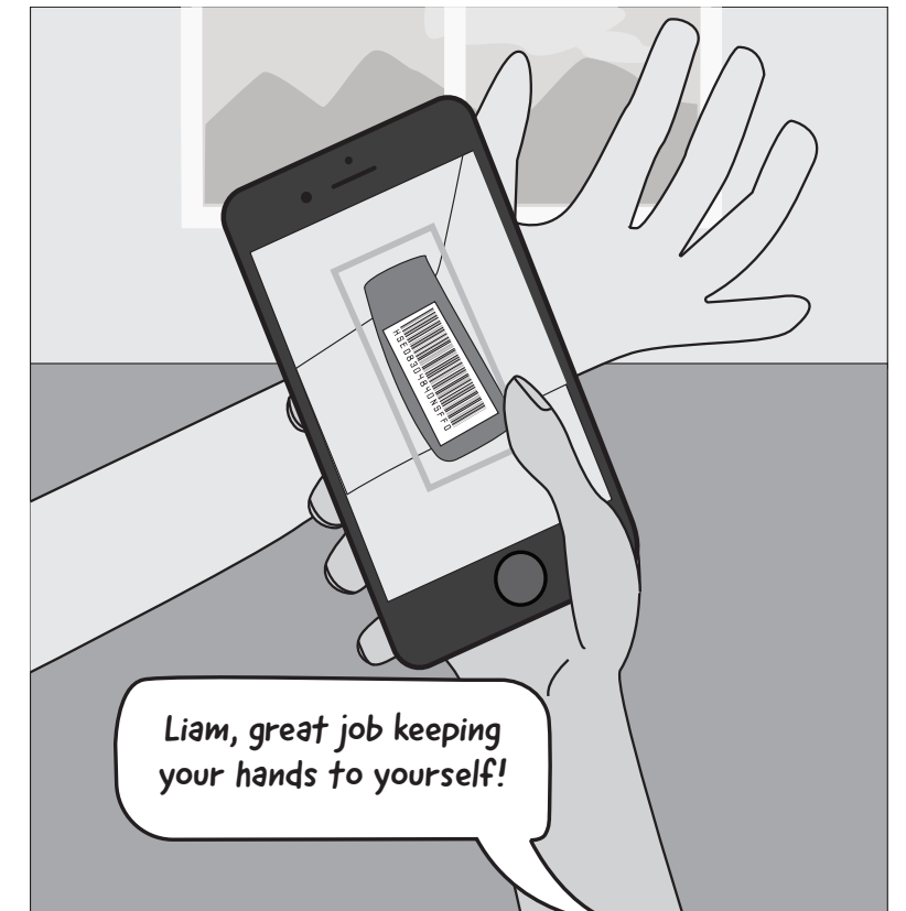
Any staff member can quickly scan a youth's bracelet to enter their points. Teachers and security members appreciate that they can contribute to the youths' behavior development in a much more positive way.