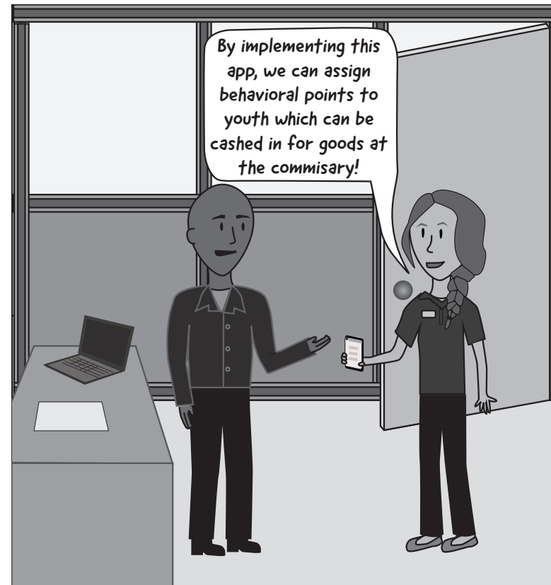
The use of a behavioral mobile application would allow youths to be recognized for exhibiting positive behavior within the matrix of "Safe", "Responsible", or "Considerate". These points can be cashed in for goods.