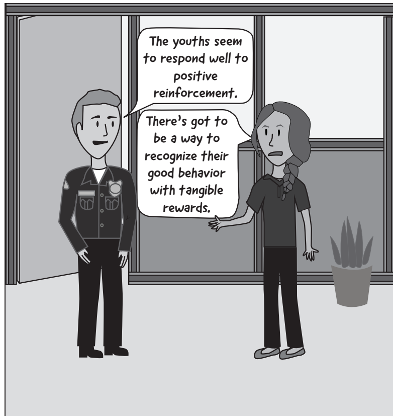
SLO County's Juvenile Hall recognizes that there could be a more effective way to minimize poor behaviors by focusing on positive reinforcement.