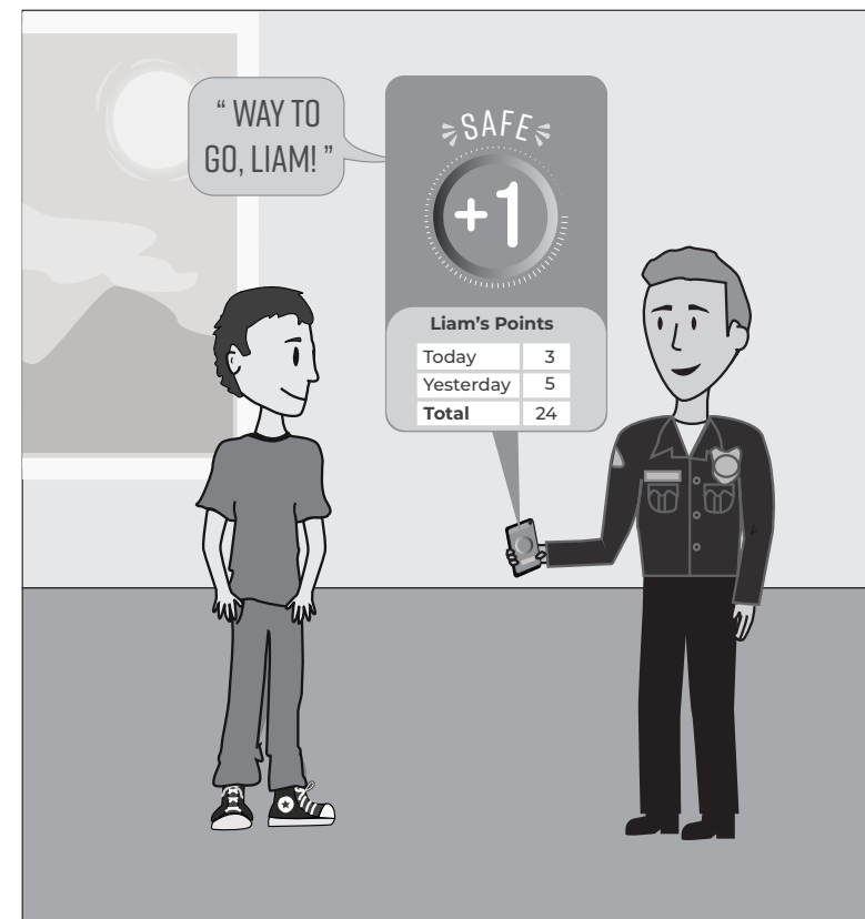
Each youth's points can be shown in a daily accrual. They feel motivated to perform well, which encourages their fellow classmates and peers.